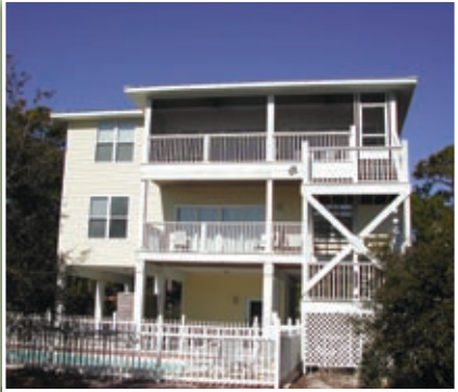
MLS# 242245 ... $465,000

4 BR (2 are masters), 3-1/2 BA with extra LR/5th BR, large open living/dining/kitchen area with tile floors, furnished, interesting architectural features, pool with vinyl fencing, enclosed outdoor shower, screened porch on top floor, covered ground level entry.