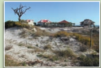
MLS# 242038 ... $249,000

KEEP COMING BACK Beautiful island home, professionally remodeled and upgraded within the past 5 years, 3 BR, 2 BA, office, vaulted, beamed ceiling in LR, secluded screened porch, hurricane shutters, very nice Gulf view! Move in condition. West Gulf Beach Drive. Listed by Michael Billings.