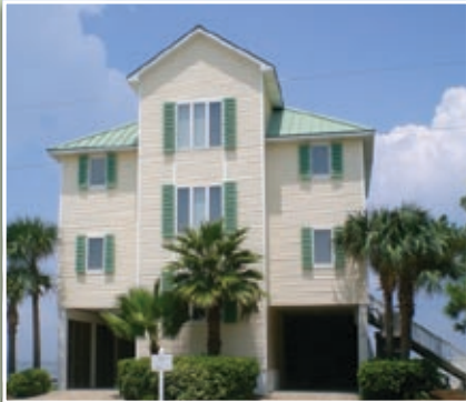
MLS# 240869 ... $629,000

Directly on the Apalachicola Bay, furnished, 4 BR (master suite on top level with private covered deck), 4 BA, 2nd living area could be 5th BR, tastefully refurbished in 2010, elevator shaft, pool, bayside covered decks, deep water, private dock with 2 boat slips, income producing.