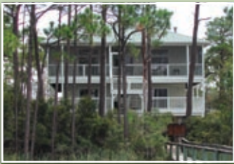
MLS# 999999 ... $499,000

EAST END BEACHFRONT LOT! 1.02 acres! 728 ft deep by 61 ft wide, street to beach lot, two rows of gorgeous dunes, bike path runs parallel to Gulf Beach Dr. State Park approx. 2 miles east and commercial area about 2 miles west. Last sale of an East End beachfront lot was $560,000.