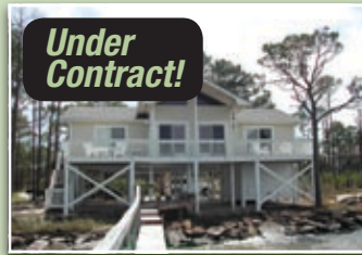
MLS# 239231 ... $399,900

BAY FRONT LIVING! Secluded on one acre in East End, new kitchen, new hardwood floors, 4 BR (3 masters), 4 1/2 BA, open living spaces leading to screened porch, fireplace, open wrap around porches, dock, sunsets over St. George Sound.