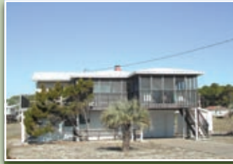
MLS# 242223 ..... $399,000

ONE ACRE LOT 2nd tier, Gulf view lot in the East End, North side of Gulf Beach Dr. Recent last sale of much smaller 1/3 acre lot at $102,000, large dune on road side of lot, 176 feet of road frontage, west and south side cleared, east and north side wooded, so you can walk much of this lot easily.