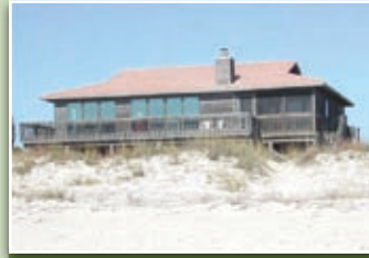
MLS# 242173 ... $599,900

FIRST TIER DUPLEX Street to street oversized 1st tier Gulf view location! Upstairs 2 BR, 2 BA (976 sf) with fire place; downstairs 1 BR, 1 BA (619 sf), kitchens on both floors, stairway connects both units, garage/work shop, storage building, outside shower and sink, covered screen porch. East Gorrie