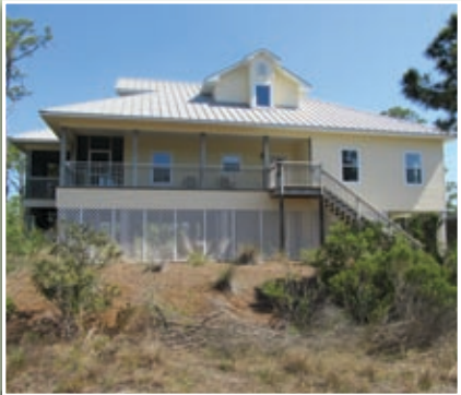
MLS# 243241 ... $839,000

Large OPEN living room/kitchen/dining area with panoramic views of Apalachicola Bay, fireplace, tile floors, huge screened porch off dining area, 5 BR & 3 BA plus additional sitting area, elevator shaft used as storage, screened enclosed pool, dock, popular rental house, privacy!