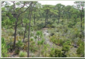
MLS# 236168 ... $95,000

ST. GEORGE PLANTATION Located in Sea Palm Village, a great one-acre interior lot on the south side of Leisure Lane with beautiful pathway through the wooded dunes to the beach boardwalk and the Gulf, large trees and vegetation, amenities include a new Club House and Pool. Bayberry Lane