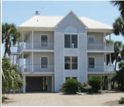
MLS# 243389 ... $1,149,000

Oversized (1.77 acres) street to beach lot, gazebo on the beach, private boardwalk, 138 feet of Gulf frontage, circular drive, waterfall and koi pond, ground level entry with beautiful tile floors, 3 BR, 2.5 BA, office nook off kitchen, cherry flooring, fireplace, furnished, newly remodeled kitchen.