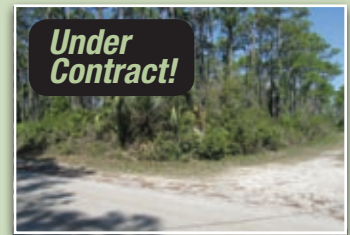
MLS# 243017 ... $49,900

ONE ACRE 1ST TIER LOT 18 ft dune near road, all adjacent beachfront lots already have houses in place. With 256 ft of depth and 166 ft of width behind 100 ft wide beachfront lots, sitting your house for the best Gulf access and view is a cinch, first one acre 1st tier East End lot to be listed in many years!