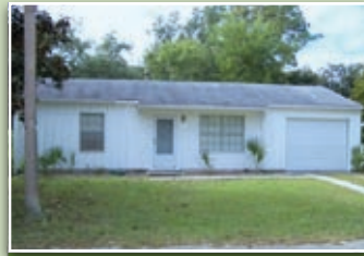
MLS# 241735 .... $99,900