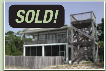
MLS# 240661 ... $379,000

LANARK VILLAGE Well-maintained home in desirable neighborhood with Bay view from front yard, high elevation property, close proximity to the Bay, Lanark Boat Club and Lanark Golf Course. 2 BR, 1 BA, appliances, HVAC and water heater like new, furnished, Carl King Ave. Listed by Janie Burke