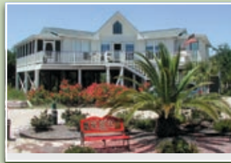
MLS# 242138 ... $372,000

AS CLOSE AS IT GETS BAY FRONT 2 BR 2 BA, Turn key furnished rental ready house. Cedar paneled ceiling and some walls in kitchen and dining rooms. Two very spacious bedrooms! Laundry room, nicely appointed kitchen, vinyl siding, dock, gutters, fireplace, short sale. UNDER CONTRACT