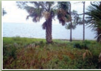
MLS# 238697 ... $99,900

ST. GEORGE PLANTATION Located in Sea Palm Village, a great one-acre interior lot on the south side of Leisure Lane with beautiful pathway through the wooded dunes to the beach boardwalk and the Gulf, large trees and vegetation, amenities include a new Club House and Pool. Bayberry Lane