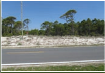
MLS#243009 ... $99,000

FEEL THE BREEZE Great Gulf view from quiet East Pine Ave, 5 BR, 3 BA (2 separate bedrooms and a bath downstairs at ground level with private entrance), tastefully furnished, tile floors, vaulted ceiling with outstanding crown molding, elevated observation platform, swimming pool! SOLD